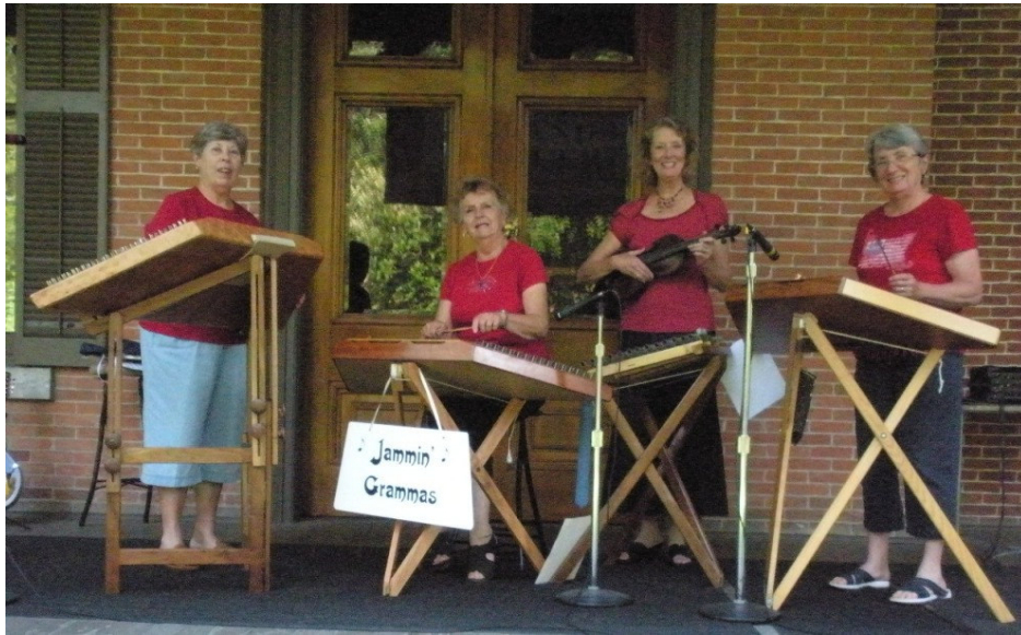
The Jammin' Grammas played at the Rutherford B. Hayes presidential home in Fremont, OH on Wednesday, June 23.