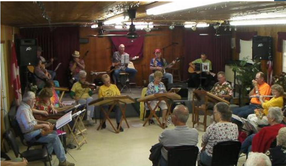
Silver Springs Group