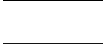
UCDC Blair Farms