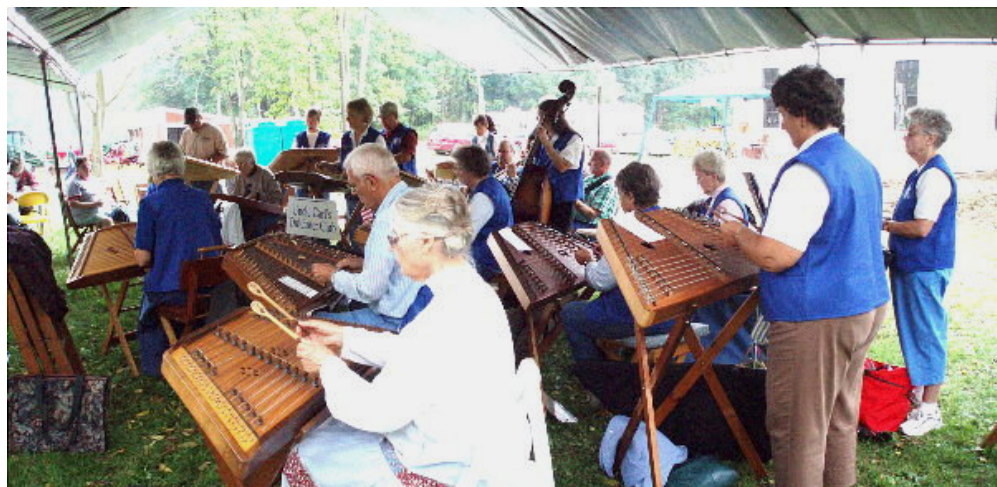
Another View of Play Date at Blair Farms Sept. 23, 2006